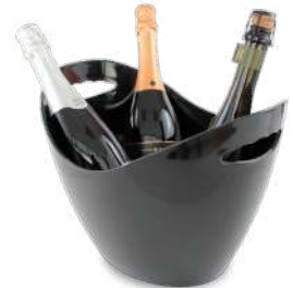
Ref. 201.29 ● BLACK