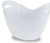
Ref. 201.371 ● WHITE