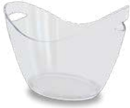
Ref. 201.36 ● CLEAR