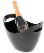
Ref. 201.37 ● BLACK