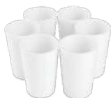
Ref. 201.35 ● CLEAR ● BLACK ○ WHITE