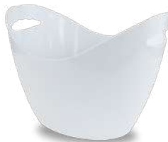
Ref. 201.28 ● WHITE