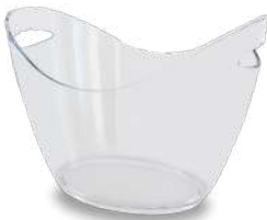
Ref. 201.27 ● CLEAR